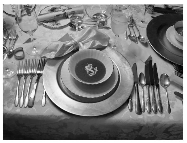
Does anyone know what all of that cutlery is for? Just ask one of the youth. They can tell you!

were infinitely more experienced with these drinking devices than others!